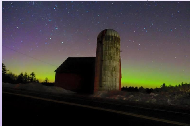
Northern Lights

"People often say that motivation doesn't last. Well, neither does bathing - that's why we recommend it daily."