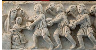
Adoration of the Magi