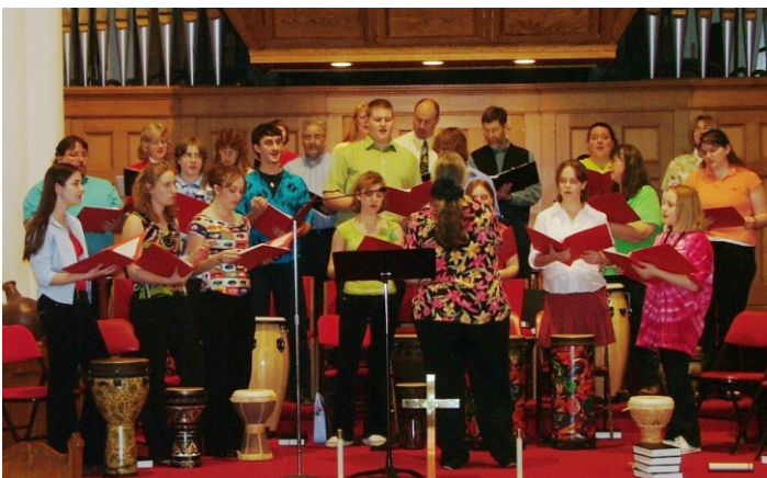
Blast from the past...Soup-er Songs May 2005 Benefit for the Soup Kitchen and Food Bank

We made T- shirts, played bean bag toss, had water games, croquet followed by pizza dinner! Next Family, Faith and Fun Night is August 23 rd from 5:30 – 8:00!