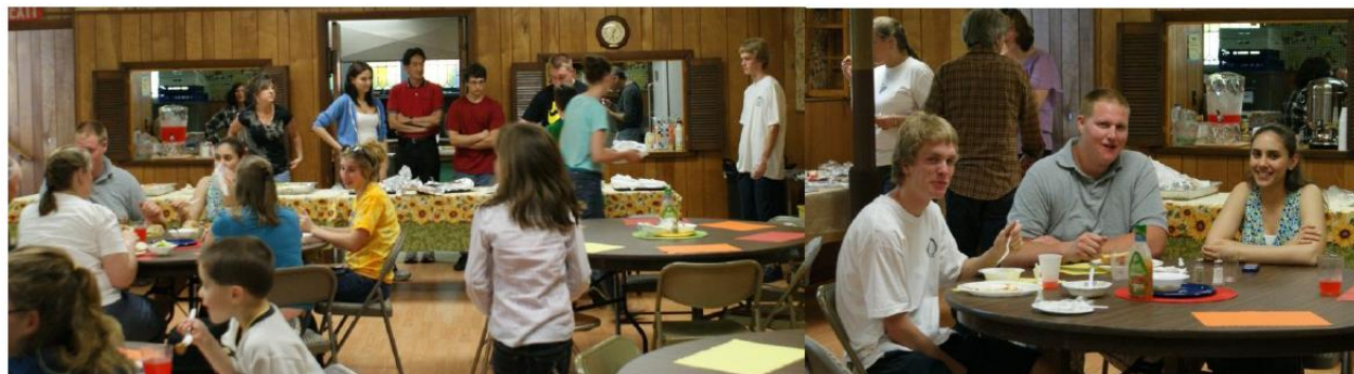
Pasta Supper crew serving and eating!