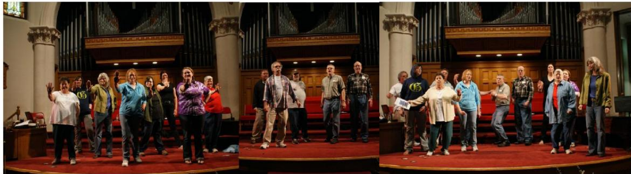
Small group from Laurel City Singers Rehearsing.. Stop in the Name of Love! Reach Out, I'll be There and Ain't No Mountain High Enough for Mozart to Motown concert.