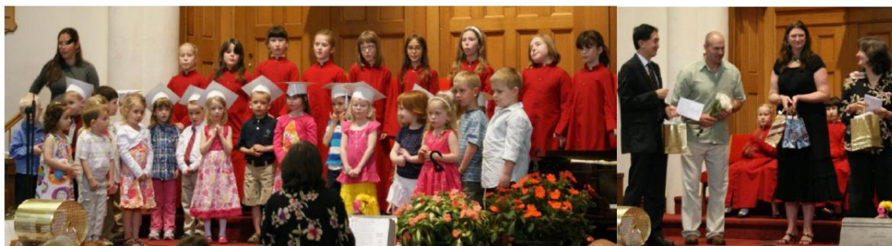
CDC Graduation... Students sing with Chorus Angelicus Training Choir