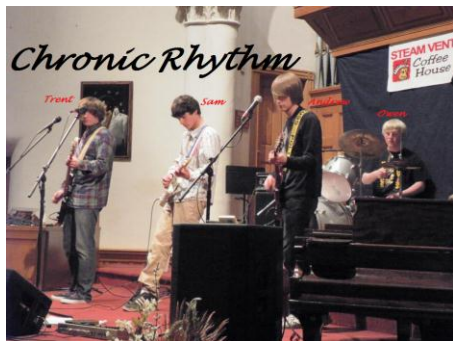
Chronic Rhythm at Steam Vent Coffee House...

April 28th directly following the worship service there will an informational meeting for 4 th -6 th graders and their parents for the New Middler's Youth Group