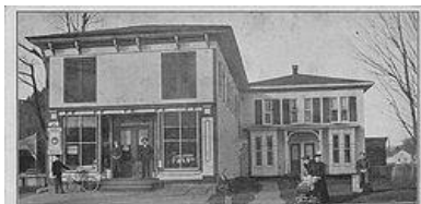
Answer: Riverton General Store 1906