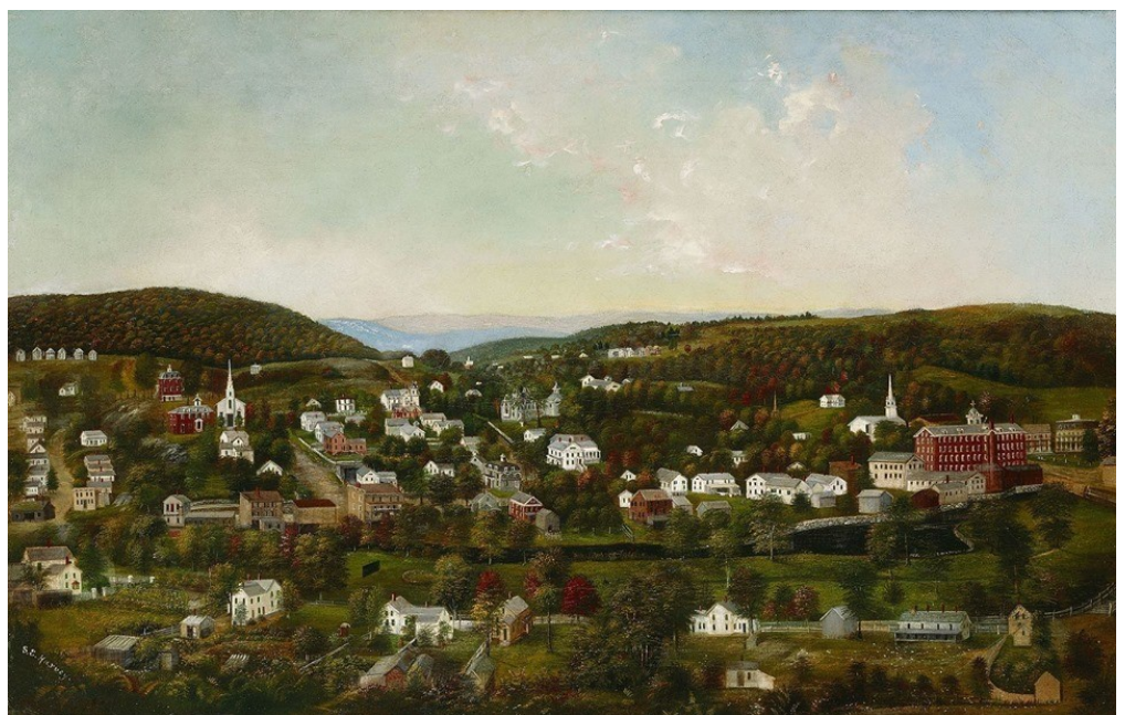
Artist rendering of Winsted Circa 1842! Note the White Church on the right...our location after the move from Wallens Hill. Artist: Unknown

DROP OFF TIMES: Thurs & Fri 10/10-10/11 from 5-8pm In the Church Dining Room!